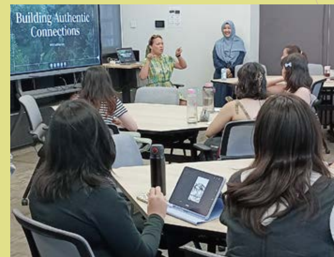
Career Skills module workshops

In preparation for two new IN-depth tracks introduced in the next academic year, facilitator training sessions were conducted to enhance workshop delivery. A Community of Practice on facilitation skills was also organised, fostering peer learning and the exchange of best practices.